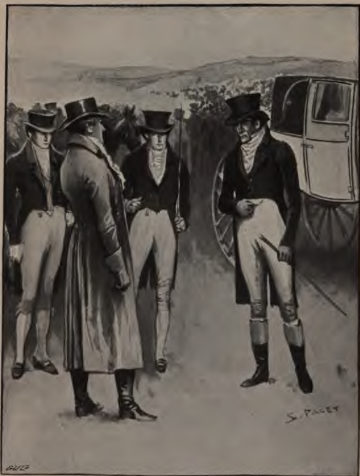
Sir Lothian's hollow cheeks grew white with passion.